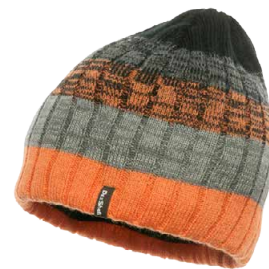
DH332NOG orange gradient